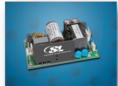
Figure 1. SL Power's MB65 65-Watt AC/DC power supply is approved to IEC60601-1, 3rd Edition 2MOPP and designed to meet 4th Edition EMC.

When selecting an AC or DC power supply—either off the shelf or custom—designers must consider the specific performance criteria suitable for their application when defining these requirements. In addition, keep in mind that transition to the IEC 60601-1-2 4th Edition standard on electromagnetic disturbance started in 2014 (figure 1).